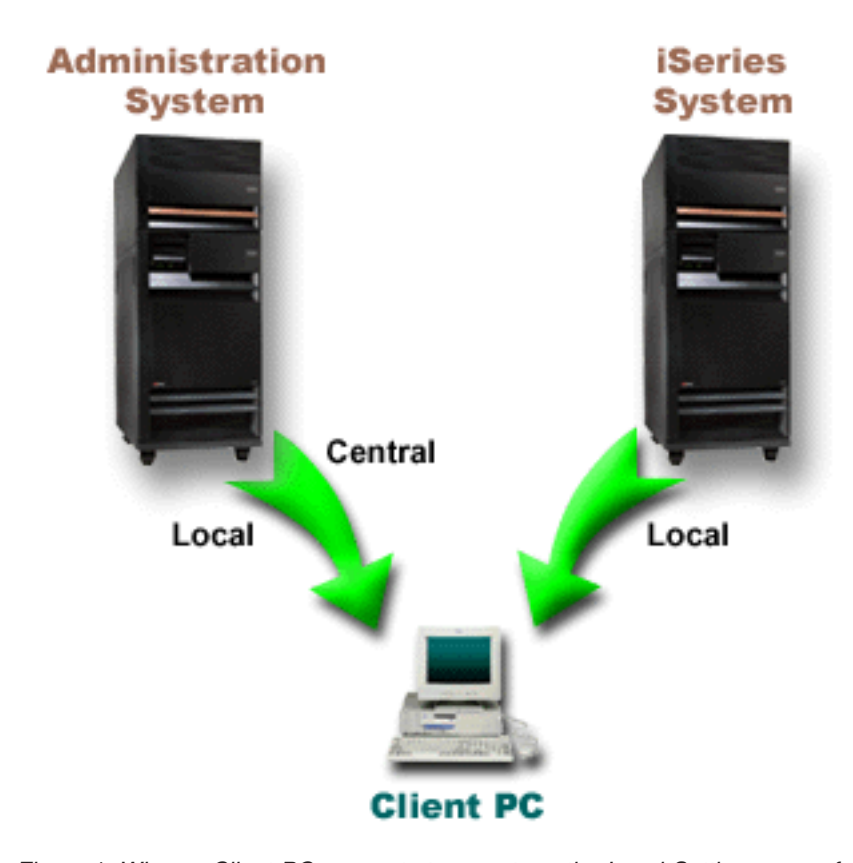
Figure 1. When a Client PC connects to a system, the Local Settings come from the system that you connect to. When you connect to an administration system, the Central Settings are sent to your Client PC from the administration system.

The administration system is a central server that is used to manage many of the properties used by iSeries Access for Windows clients. A system administrator must use Application Administration to configure an iSeries server before it can act as an administration system. If you right-click a system and select Application Administration, you will see the additional choices Local Settings or Central Settings if that system is already defined as an administration system. Typically, a network will have only one iSeries server acting as an administration system. For an example network, see Figure 1. This administration system will be used by iSeries Access for Windows clients as the source of their Central Settings for Application Administration. Although a network can have multiple iSeries servers defined as an administration system, the iSeries Access for Windows clients will only use a single administration system for their Central Settings.