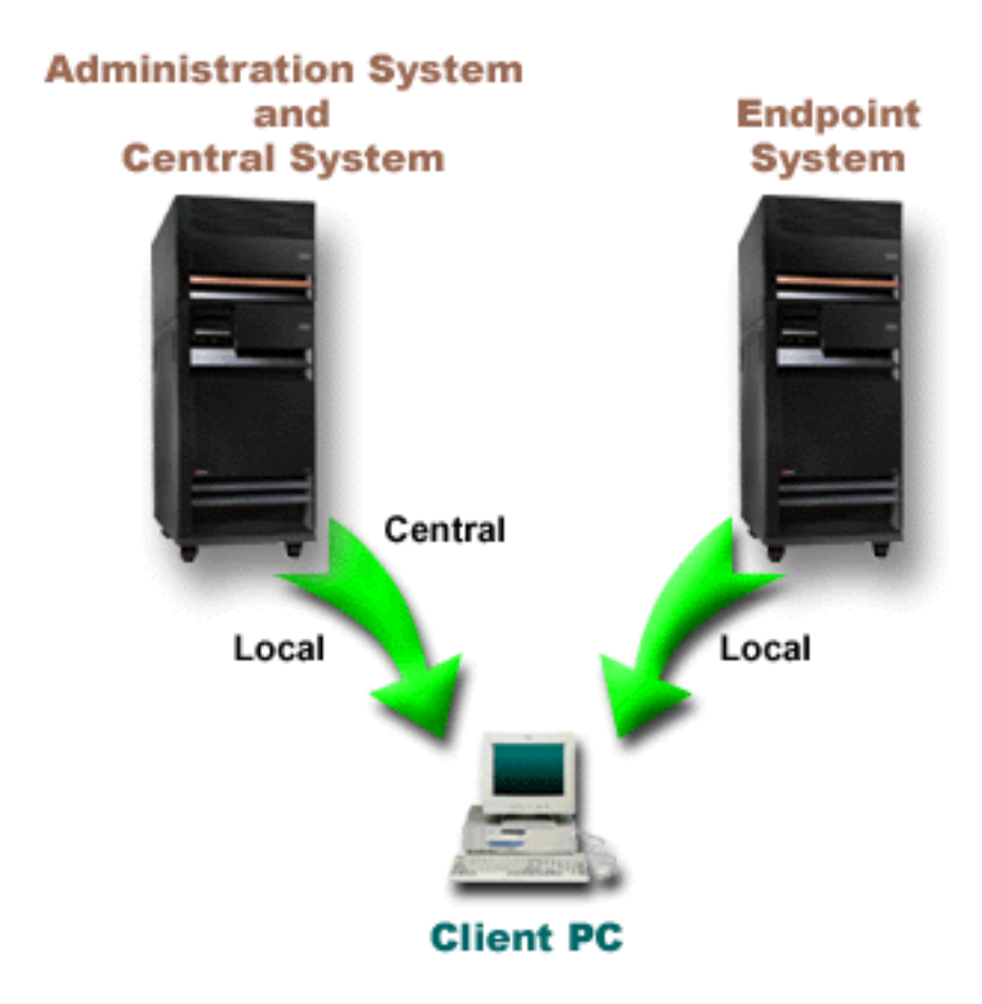
Figure 3. The administration system and the central system can be the same system. It does not change the function of Application Administration or Management Central. When a Client PC connects to a system, the Local Settings come from the system that you connect to. When you connect to an administration system, the Central Settings are sent to your Client PC from the administration system.