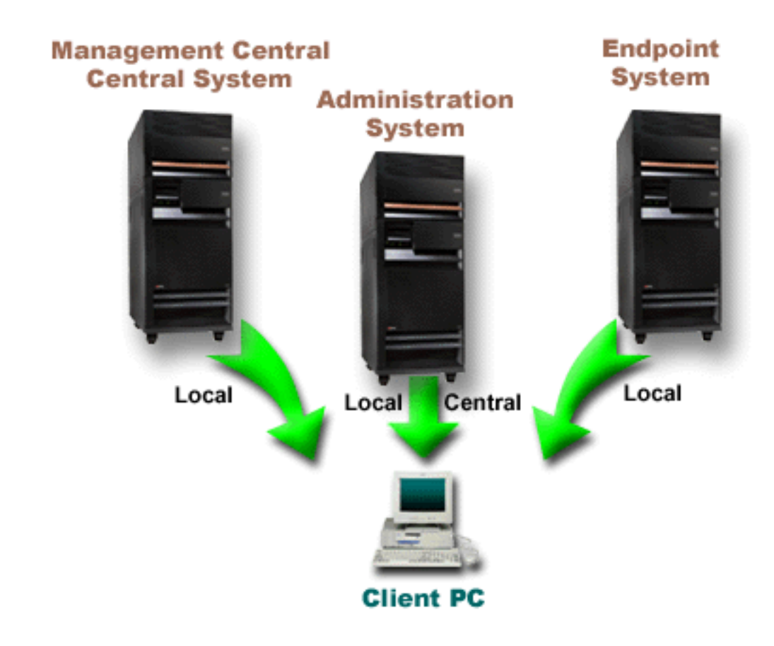
Figure 2. When a Client PC connects to a system, the Local Settings come from the system that you connect to. When you connect to an administration system, the Central Settings are sent to your Client PC from the administration system. This network does not change the function of Application Administration or Management Central.

To see how Application Administration works in a network with Management Central, see Figure 2.