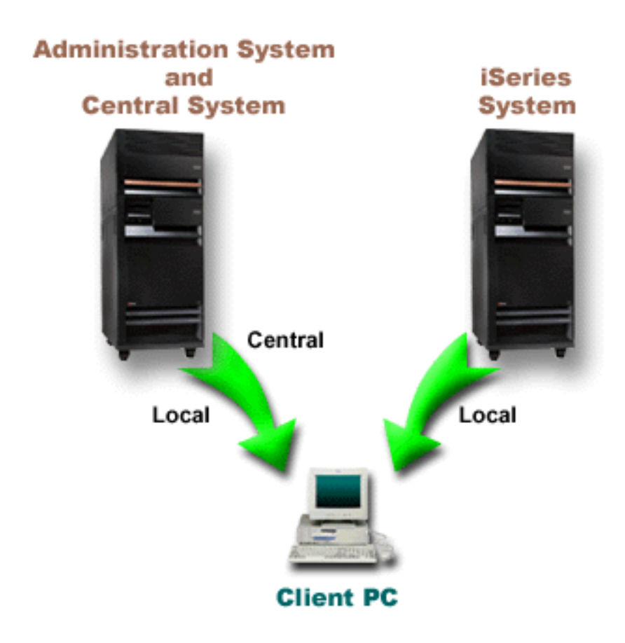
Figure 3. The administration system and the central system can be the same system. It does not change the function of Application Administration or Management Central. When a Client PC connects to a system, the Local Settings come from the system that you connect to. When you connect to an administration system, the Central Settings are sent to your Client PC from the administration system.