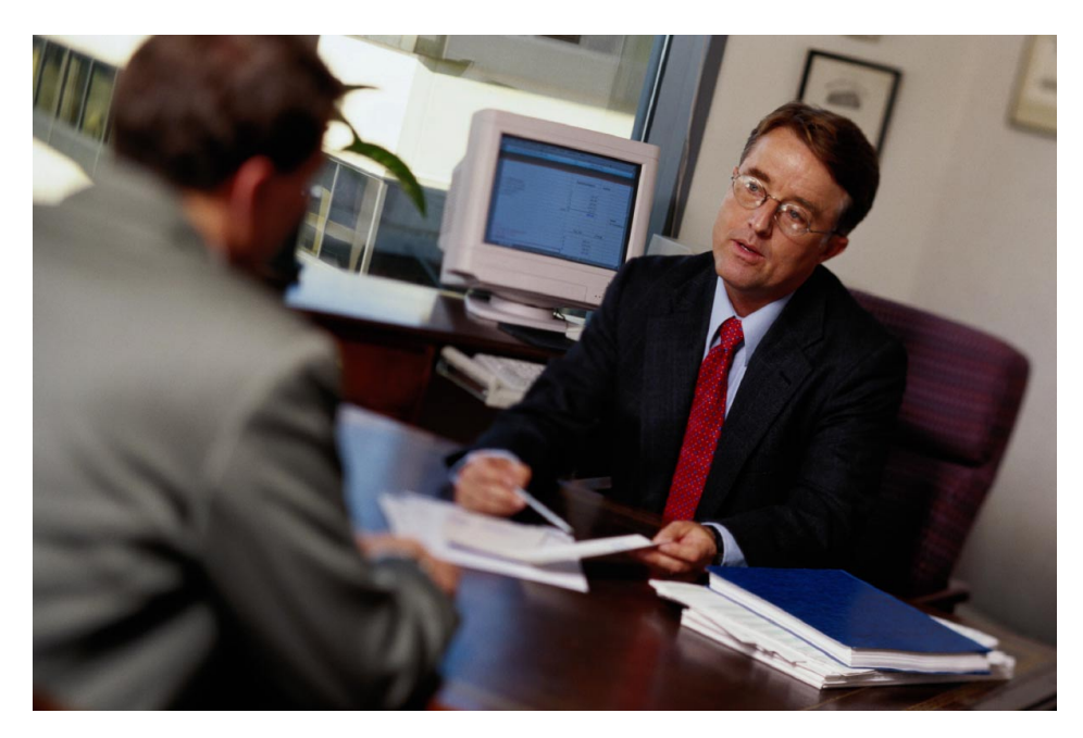
WebSphere Business Components Composer, a part of the WebSphere software multichannel banking solution, provides a set of components designed specifically for retail banking applications.

The solution lies in a set of tools that lets you leverage and reuse components across all retail banking delivery channels. Prebuilt, pretested software packages that work together. And are easily tailored to meet your specific needs. Interoperability. Customization. Not as afterthoughts, but as basic principles woven into the architecture. The WebSphere® software multichannel banking solution from IBM is comprised of IBM WebSphere Business Components Composer a strategic product within IBM financial services solutions—to enable software development that keeps pace with your ever-changing needs. Jump-start your e-business by delivering applications to market quickly—ahead of the competition.