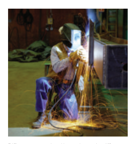
Different occupational hazards require different types of safety shoes, and Lehigh Valley Safety Shoes now has a cost-effective vehicle for selling a full range of safety footwear.

Unlike its competitors, Lehigh Valley Safety Supply saw an opportunity in 1996, when it launched the industry's first online safety shoe storefront using IBM Net.Commerce (now called WebSphere Commerce Suite). Lehigh initially showcased its 12 most popular shoes but quickly added more styles to its online catalog as sales increased. Helped by its Web sales, Lehigh Valley Safety Supply has become the largest independent supplier of Lehigh Safety Shoes in the U.S. It still provides shoemobile service to companies located in Eastern Pennsylvania, New Jersey, New York and the Delmarva Peninsula. But with its Web site now firmly established among factory workers and growing among company purchasing agents nationwide, it is well ahead of the rest of its industry in cutting sales costs by shifting to e-commerce. And Lehigh is staying ahead of the competition with its new Web site, which incorporates the enhanced functionality of IBM WebSphere Commerce Suite, Version 5.1.