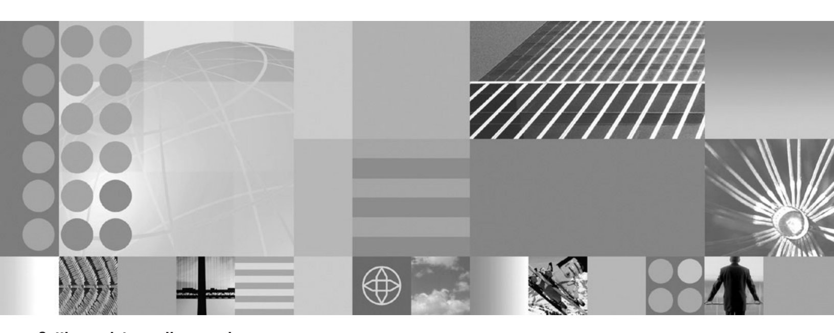
Setting up intermediary services