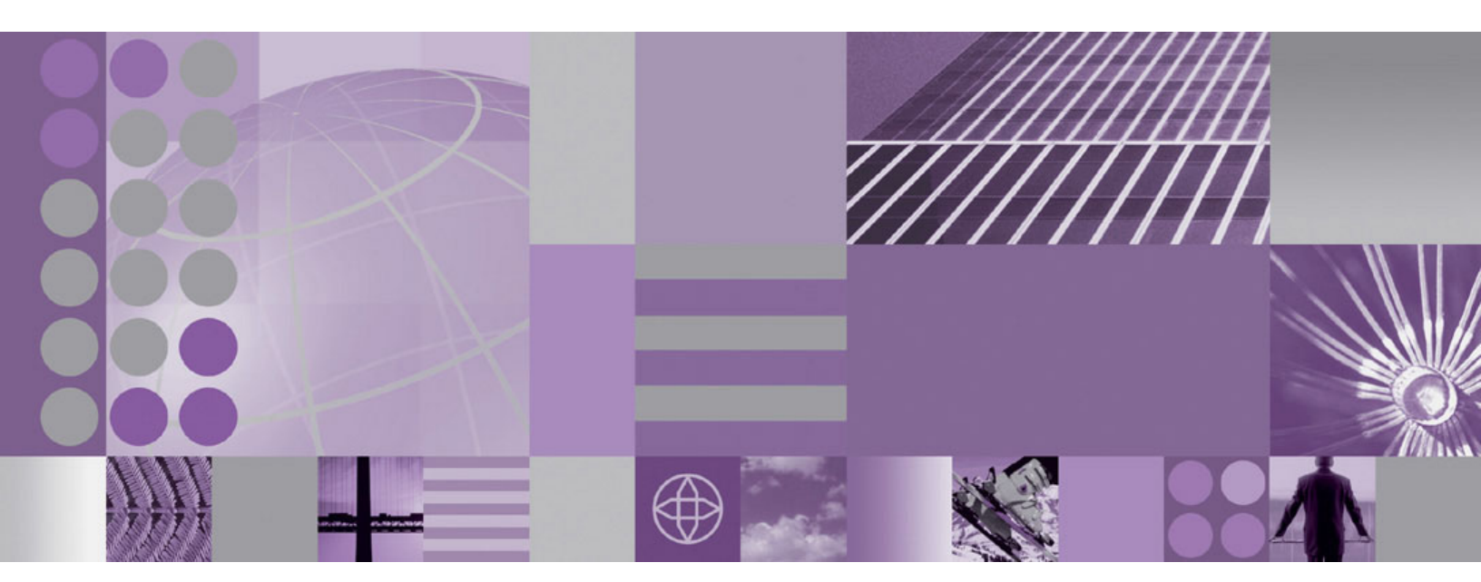
Extended Deployment Compute Grid Version 6.1.1 Installation Guide