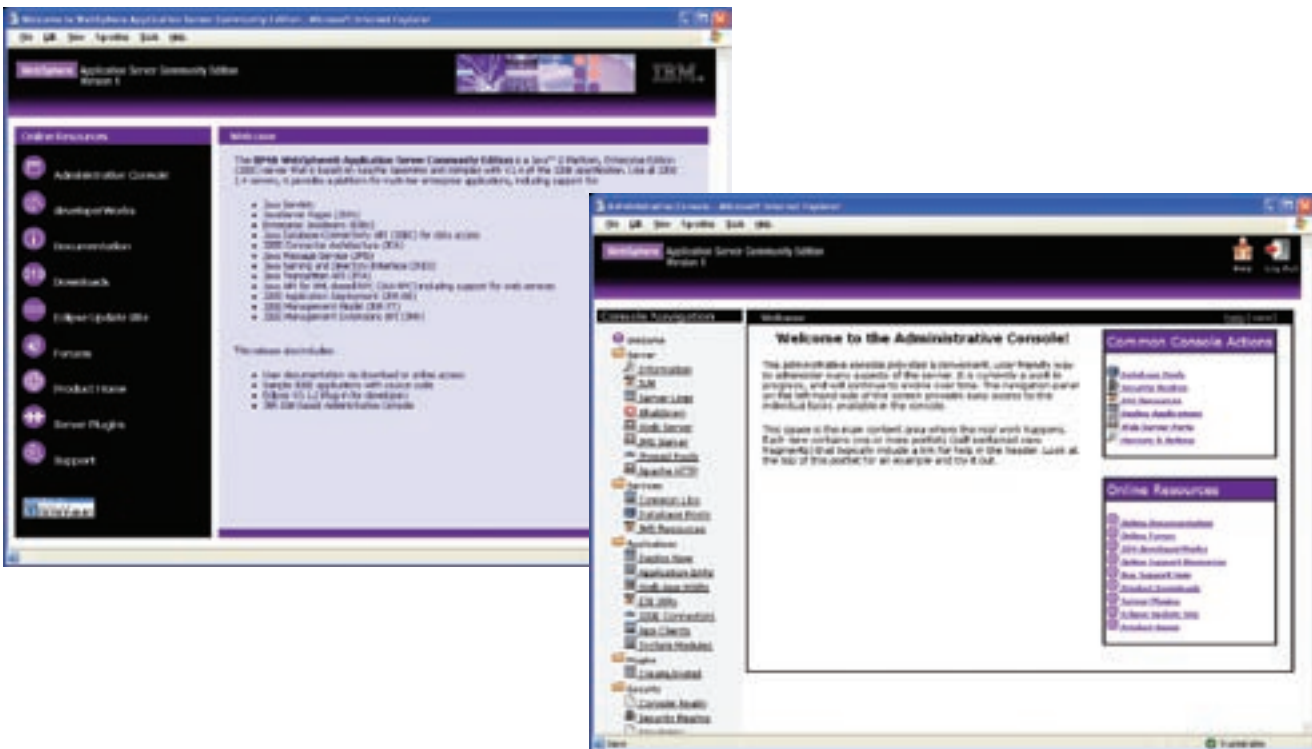
An easy-to-use, browser-based administrative console eases the burden of managing and monitoring your application server and related resources.

WebSphere Application Server Community Edition, released under the IBM License Agreement for Non-Warranted Programs (ILAN), can be used at no charge in development, testing and production. You can make unlimited copies of the software for internal use. Because WebSphere Application Server Community Edition uses open-source technology as its foundation, you can obtain the source for these components through the open-source community. And should the need arise, you can make modifications as allowed through the component license.