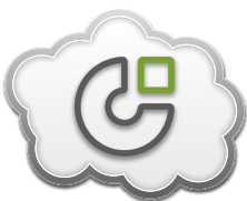
Cast Iron Cloud™

The Cast Iron Cloud is our integration-as-a-service solution. Using a "develop once, deploy anywhere" approach, the Cast Iron Cloud is ideally suited for companies that seek a solution for SaaS-to-SaaS integration for two or more applications.