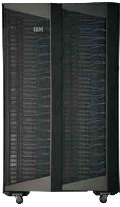
iDataPlex technology delivers innovative design for optimized density in the data center.

used to actually cool the room—helping reduce or even eliminate the need for air conditioning in the data center<sup>2</sup>. Using an iDataPlex solution with the Rear Door Heat eXchanger could mean the difference between keeping data center costs under control or seeing them skyrocket.