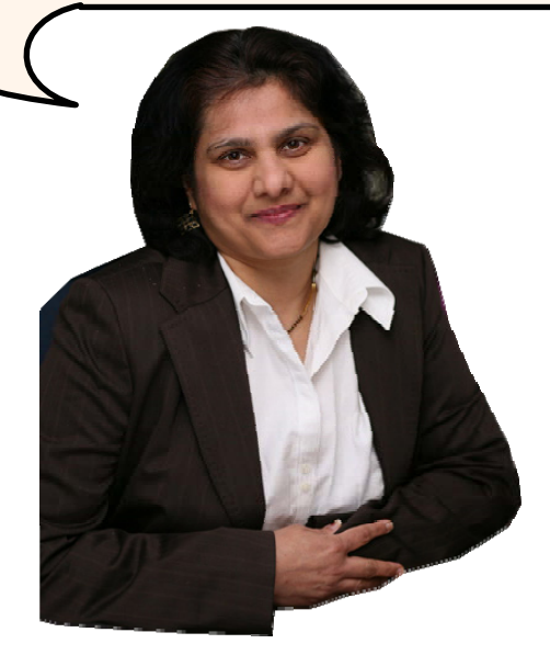
Service Oriented Finance CIO

So mainframe extension sounds like the strategy I need.