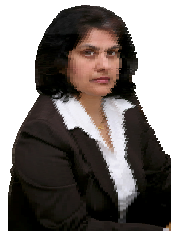
Service Oriented Finance CIO

WebSphere Studio Asset Analyzer can help them