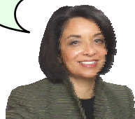
Service Oriented Finance CEO

I am glad to see you have reduced our programming costs and our application backlog