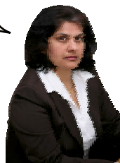
Service Oriented Finance CIO

We have a lot of new solutions to build. If I build them all on System z, I will have to find more System z development skills