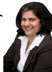
Service Oriented Finance CIO

Increased productivity using WSAA and WDz made this possible. I didn't need to hire more System z development skills.