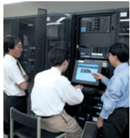
Tivoli Access Manager is part of a comprehensive Web authentication infrastructure, which VGJ envisions will enable users to sign on once to access all their online applications.