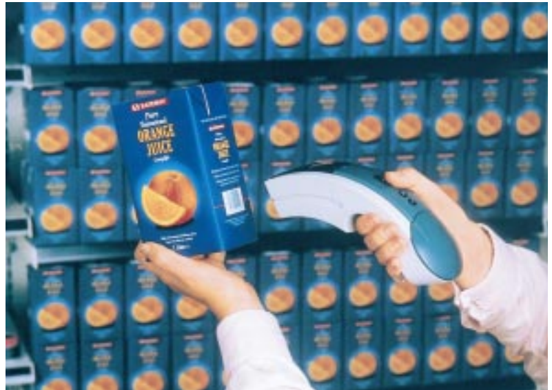
Safeway's suppliers are using its supply chain management system to keep their products in stock in more than 525 stores across England.

But SIS enables a strategic, collaborative approach toward promotions. Safeway buyers and supplier account managers now plan promotions on an annual basis. These promotions are then tracked and synchronized during implementation by the appropriate buyers and suppliers. During the promotion, production can be ramped up or inventory shifted to meet variable consumer demand. SIS captures the data from the promotion, which allows the participants to analyze effectiveness. More importantly, this data is stored to provide a