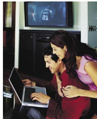
Using WebSphere software, eBay delivers an engaging online marketplace experience.