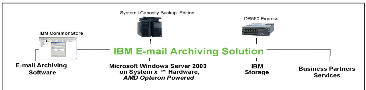
Technical Architecture for Implementing the Email Archive Preload Solution

IBM CommonStore eMail Archiving Preload is a software and hardware solution that helps address your immediate and future challenges with growing e-mail systems. This solution archives e-mail and attachments into IBM Content Manager, where they are retained according to your company's governance, compliance and legal support policies but remain accessible to users. To make things easier for mid-sized companies, it comes with the IBM CommonStore and Content Manager software already loaded and tested on a high performance, low power IBM System x platform powered by next-generation AMD processors. It is also offered as a Solution Starting Point from the Solutions Builder Express Portfolio, and your Business Partner can use it to speed implementation of your e-mail archiving and compliance solution.