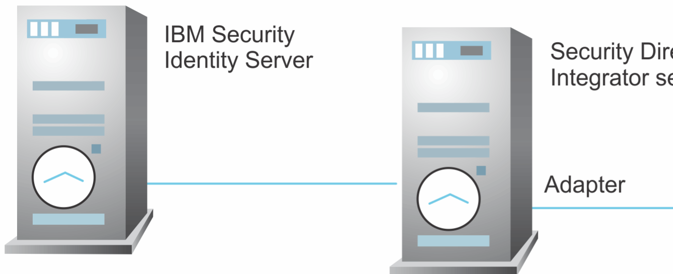
Figure 3. Example of multiple server configuration

Install the Identity server, the Security Directory Integrator server, the UNIX and Linux Adapter, and the UNIX or Linux operating system on different servers. Install the Security Directory Integrator server and the UNIX and Linux Adapter on the same server as described Figure 3 on page 3 .