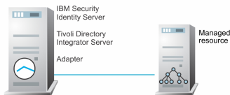
Figure 2. Example of a single server configuration

The IBM Security Verify server is installed on a different server as shown in Figure 2 on page 2 .