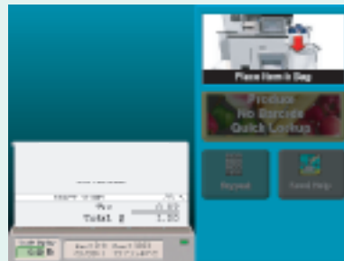
Figure 3: Locked Lane