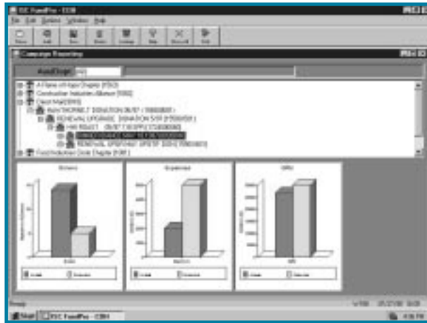
► Event analysis screen from City of Hope fundraising campaign database system – the lifeline of the medical center’s financial activities – tested by Rational TeamTest.

Today, after years of work, most of the City of Hope’s centralized fund-raising database, with its many customized bells and whistles, is up and running. A large production database, in operation for queries since 1997, the system is now fully functional and contains some 1.8 million gift records, 390,000 demographic records and more than 3,000 fields. This system is mission critical for City of Hope and contains key information that not only allows City of Hope to keep its doors open, but to provide new health services and further its cancer research.