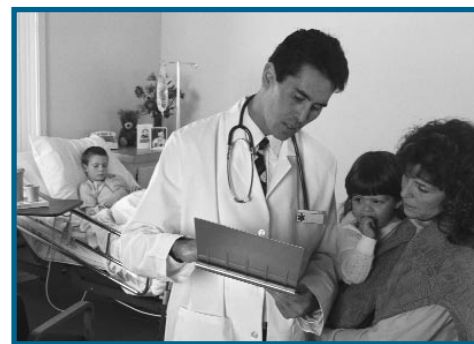
CHCF deploys the nation's first e-business application to enroll low income residents in public health insurance programs.

The California HealthCare Foundation ( www.chcf.org ) is a three year old philanthropic organization based in Oakland, CA. Its mission is to improve the health and well being of Californians, with a special emphasis on low-income Californians. In an effort to bring streamlined business practices to the Medi-Cal and Healthy Families Programs, CHCF and its Medi-Cal Policy Institute ( www.medical.org ) recently decided to develop an e-business solution to improve the enrollment process. What soon became apparent in the early project planning stages was that on-line enrollment would involve far more than simply creating Web-enabled versions of the existing paper forms. A brand new e-business solution that offered an interactive, interview style application, and that was both highly accurate and easy to use would have to be developed, tested, and quickly brought on-line. The cost of system malfunctions, both in human and economic terms, could be high. For CHCF, which had limited prior experience hosting business applications, the venture, while necessary, was also a potentially risky investment.