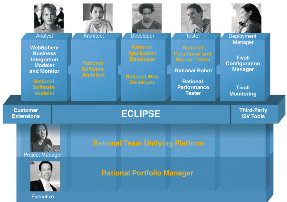
Figure 1: Eclipse provides the technology foundation for the IBM Software Development Platform

For the architect role, we announced our next-generation product for modeling and model-driven development: Rational Software Architect. Rational Software Architect is not the next version of Rational Rose or Rational XDE, but rather represents a fusion of select capabilities and development paradigms supported by Rational Rose, Rational XDE and WebSphere Studio Application Developer. Rational Software Architect takes features from these three tools, adds additional MDD capabilities, introduces new structural review and control capabilities and hosts it all on the Eclipse 3.0 platform. The result is a comprehensive design and development solution specifically targeted to the needs of software architects who also develop or otherwise touch code.