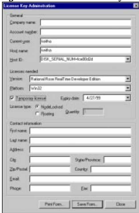
Figure 5 Permanent License Key Administration form

The Permanent License Key Administration form appears (see Figure 5).