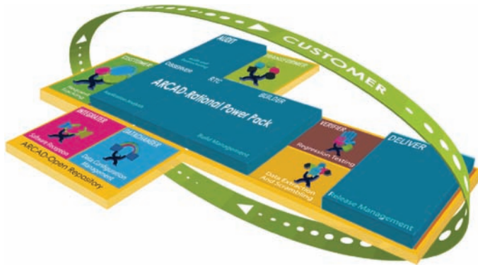
Figure 3: Graphic summarizing the four ARCAD tools that comprise the ARCAD-Rational Power Pack integration.

ARCAD and IBM have validated the integration of key ARCAD tools as Ready for Rational Software with IBM Rational Team Concert and IBM Rational Developer for Power, designed to help deliver solutions for modernizing your IBM i world.