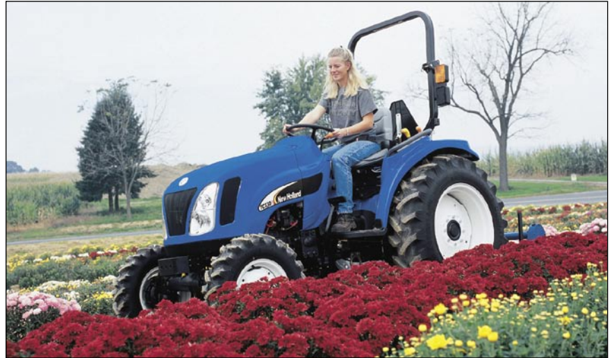
New Holland streamlined its order entry system by providing a Web-based, self-service solution that dealers can use instead of tying up resources in the company's call center.

77% increase in dealer satisfaction for whole-goods ordering processes among New Holland Agricultural dealers as well as New Holland and Kobelco Construction dealers; thousands of dollars saved by reassigning call center employees to higher value work; accelerating inventory improves dealers' bottom lines; receiving orders faster improves cash flow for New Holland; solution launched on time and under budget