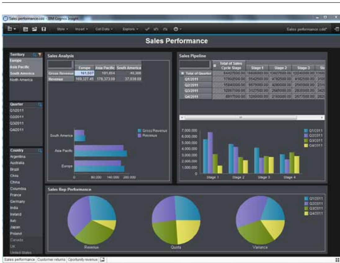
Figure 3: “What-if” scenario modeling lets you analyze and optimize your plans based on different assumptions that take into account ever-changing market conditions.

To easily navigate through large data sets with multiple dimensions, you can filter results based on the association between related groups of information. You can even apply a simple search to these explore points to further drill down to a particular member in a set and other information related to that member. When combined with visualizations, this powerful point-and-click approach allows you to quickly spot trends and identify outliers.