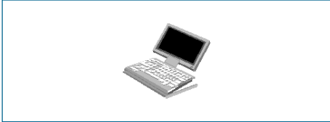
Rational Test RealTime Unit Testing feature used with a target microprocessor simulator