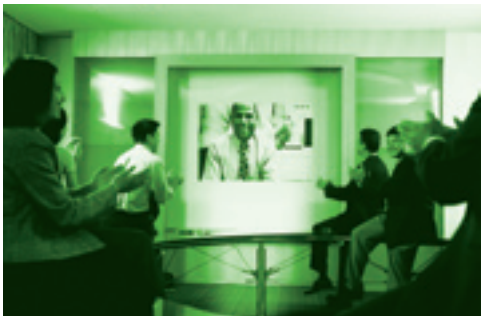
Content Manager VideoCharger makes virtual presentations a breeze by streaming video to a monitor near you.

Content Manager VideoCharger provides an integrated desktop player for realtime video delivery of multiple file types. A part of the IBM content management portfolio of offerings, Content Manager VideoCharger can be integrated with IBM Content Manager, letting you combine multimedia data with other data types in an enterprise content management infrastructure. The latest version of Content Manager is a multimedia