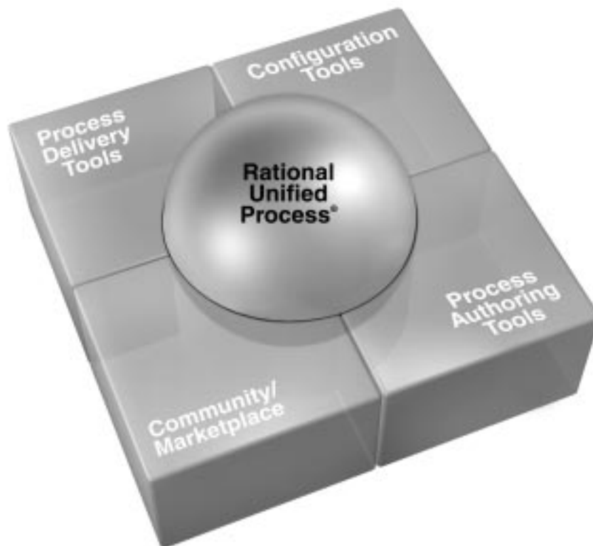
The RUP platform provides the methodology and tools you need to provide your team with customized, practical process guidance.

Available where and when needed, IBM Rational software Services improve self-sufficiency as they build a foundation for continuous software development improvement.