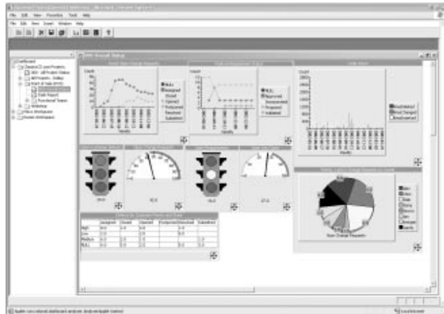
IBM Rational ProjectConsole features a metrics dashboard to easily and consistently capture "true" project status from other Rational Suite solutions and third party tools.

What sets the Rational Suite family apart from other solutions is the Team Unifying Platform, a collection of integrated tools. The Team Unifying Platform, includes two types of integrated solutions— collaborative