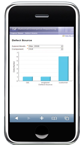
Figure 2: Stay informed wherever you are with status indicators and e-mail alerts.

With Rational Insight, you no longer need to waste time waiting for status reports, asking multiple people for updates, basing your work on outdated information or digging through different databases and documents. Rational Insight provides you with a single, personalized view of the information most relevant to your needs.