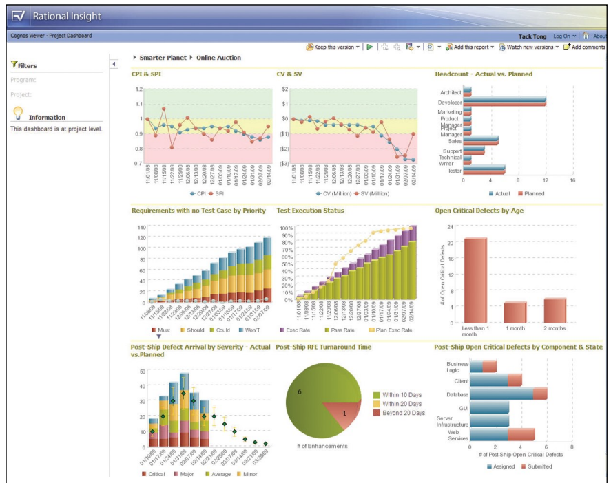
Figure 1: Rational Insight automates the measurement and analysis of actual on demand data to improve software and systems development and delivery.

By having this vital information at your fingertips, you can take prompt corrective action, assess reasons for missed deadlines, set realistic project expectations and make better-informed decisions.