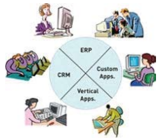
Figure 3: EA must support all users and their skill levels.

A key challenge for business change and transformation initiatives relates to participation and collaboration. Business processes have many touch points within an organization and typically involve nuances or vague complexities. Process experts can be managers, subject matter experts, business analysts, IT personnel or long-tenured staff. Thus,