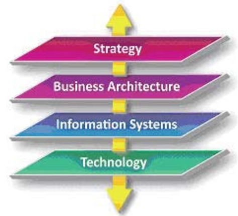
Figure 1: EA translates strategies into effective change

Though businesses require change to improve and grow, they must also manage that change to ensure they yield measurable improvements and to avoid creating problems elsewhere.