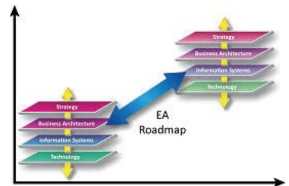
Figure 2: An EA roadmap plots a course from the current to the future EA

unencumbered with the known weaknesses of the current organization. Then, this view of the future organization creates the template that identifies which current business processes and technologies will be necessary for future transformation.