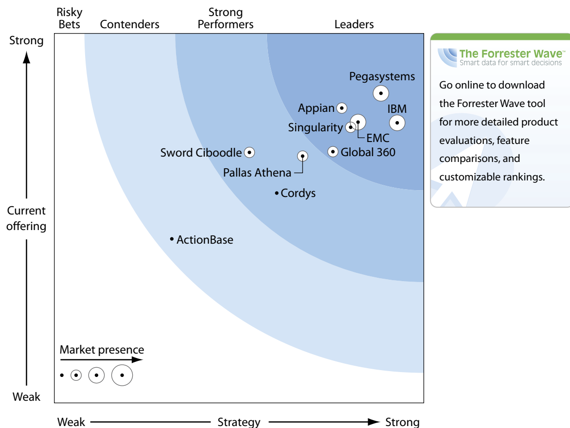
Figure 4 Forrester Wave™: Dynamic Case Management, Q1 '11

We intend this evaluation of the dynamic case management market as a starting point only. We encourage readers to view detailed product evaluations and then extend the list of vendors to include some of these or adapt the criteria weightings to fit their individual needs through the Forrester Wave Excel-based vendor comparison tool.