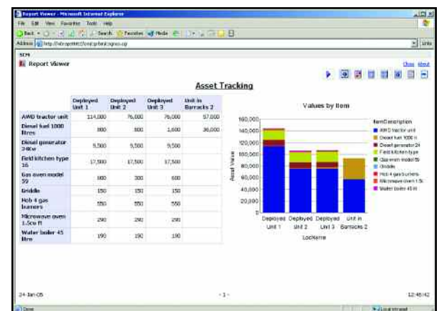
Analyze and report on inventory levels