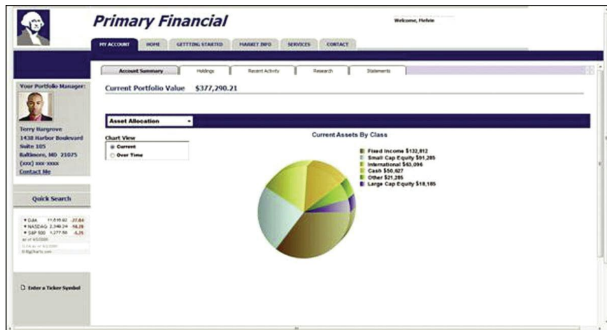
Figure 3: Self-service module