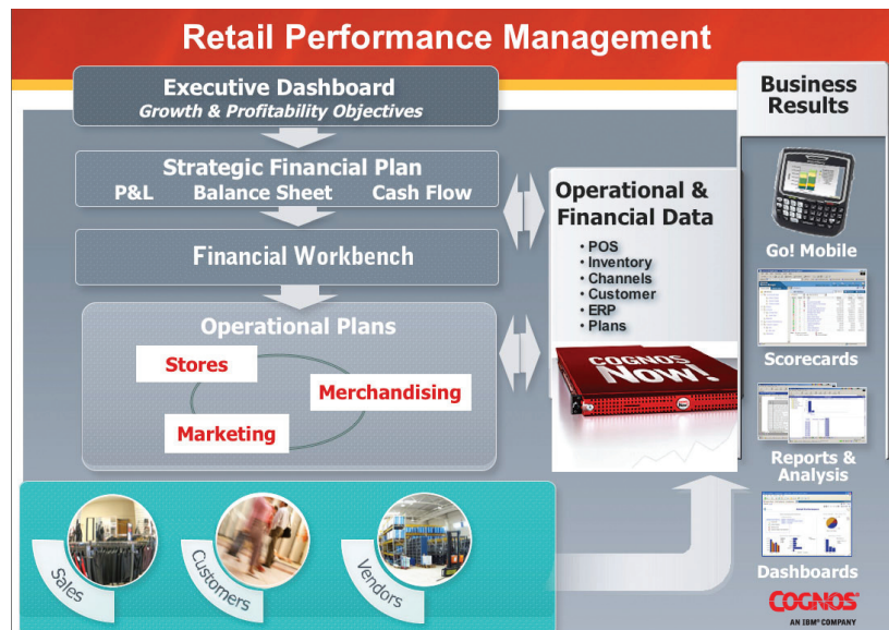
The IBM Cognos solution strategy links store and channels operations, marketing, and merchandising with finance and executive management so that all parts of the organization are working towards a single set of business goals and financial objectives.