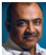
Arvind Krishna General Manager, Information Management Software IBM Corporation

Monday, October 22 11:30 a.m.–12:30 p.m.