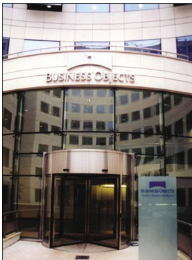
With headquarters in Paris, France, and San Jose, California, Business Objects helps customers worldwide enhance their operational efficiency.

By leveraging the information that is stored in an array of corporate databases, as well as enterprise resource planning (ERP) and customer relationship management (CRM) systems, Business Objects's solutions enable companies to analyze and anticipate revenue cycles, supply chain performance, customer behavior and more by monitoring performance against goals, executing on bottom-line business drivers and collaborating for faster, smarter decision making.