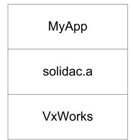
Figure B.1. One image: VxWorks + solidac.a + your application