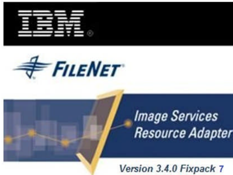
Image Services Resource Adapter