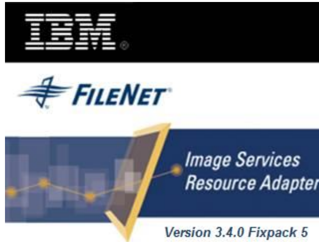
Image Services Resource Adapter