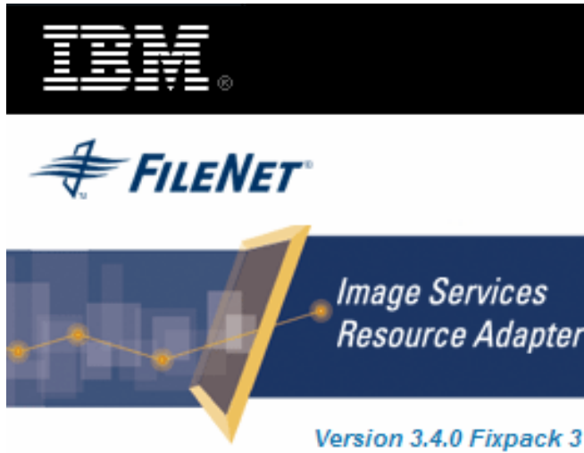
Image Services Resource Adapter