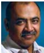
Arvind Krishna General Manager, Information Management Software IBM Corporation

Monday, October 22 11:30 a.m.–12:30 p.m.