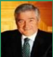
Louis V. Gerstner, Jr. (1993 – 2002)