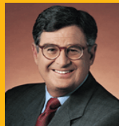
Samuel J. Palmisano (2003 – 2011)