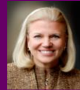
Ginni Rometty (2012 to present)