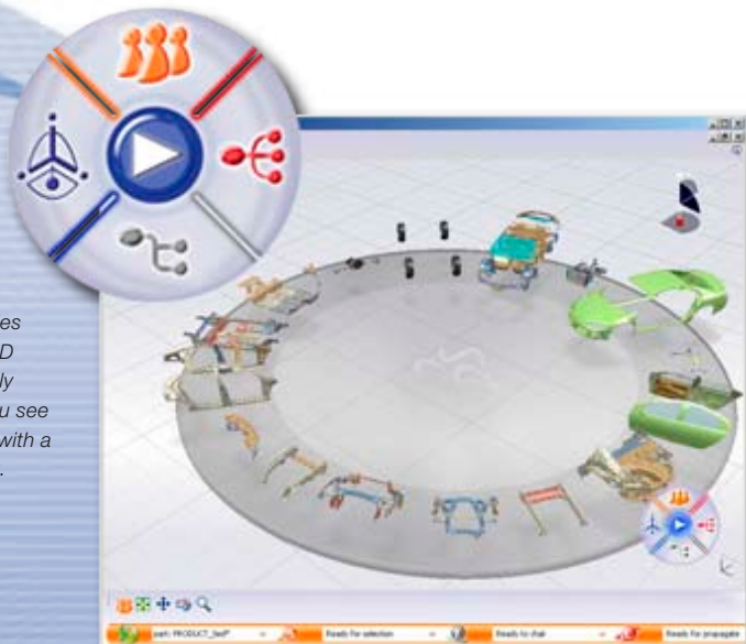
3D Compass guides you through your 3D PLM universe, easily controlling what you see and where you go with a simple mouse click.

3DLive facilitates the collaboration between the different people who need to leverage intellectual property in decision making processes. Users have the ability to get connected, at anytime, with the people relevant to their work-context. By simply clicking on a part, users are instantly aware if the part's owner is online or not and they can easily start a real-time chat session with those owners that are online. When discussing the product with other online participants, users can start a dynamic 3D sharing and co-navigation with the 3DHeads-up capabilities to share what they see and explain what they mean.