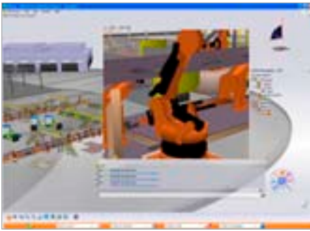
3D Heads-up enables dynamic chat, 3D image-sharing, co-navigation, and annotation!

adds robust collaborative review capabilities to the powerful search, visualize and navigate paradigm delivered in 3DLive. Providing out-of-the box support for CATIA—3DLive, the Live Collaborative Review solution increases your business agility by supporting design reviews anytime, anywhere people need specific product information to make decisions and drive downstream activities.