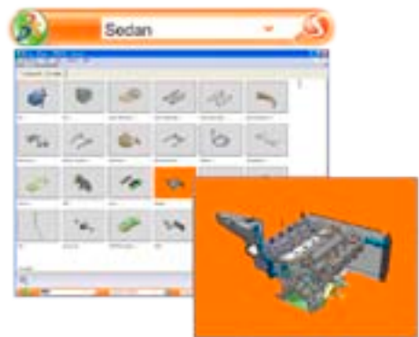
3D Search! Download and install...with the 3DLive toolbar in your browser you can find data and projects, query indexed databases, and check for dependencies and impacts in minutes instead of hours.

The ultimate goal of 3DLive is to optimize your company's unique knowledge environment so that people get the contextual information they need to be productive and innovative—no matter what their job, language, or location. Here's how.