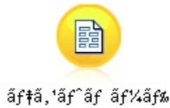
Figure 3. Node label containing non-ASCII characters, displayed incorrectly

However, the resulting node will have an incorrect label.