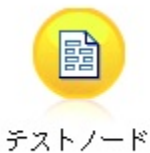
Figure 4. Node label containing non-ASCII characters, displayed correctly

This will create a Unicode string and the label will be appear correctly.