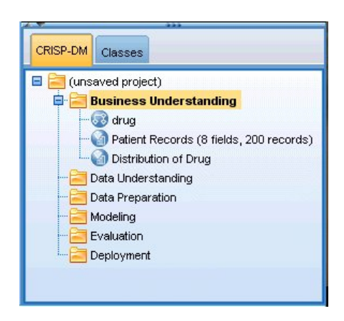
Figure 2. CRISP-DM project tool

The CRISP-DM project tool provides a structured approach to data mining that can help ensure your project's success. It is essentially an extension of the standard IBM SPSS Modeler project tool. In fact, you can toggle between the CRISP-DM view and the standard Classes view to see your streams and output organized by type or by phases of CRISP-DM.