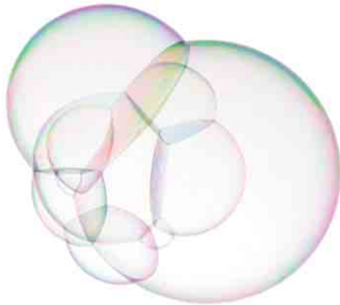
SOA lets service components join and rejoin together in any combination.

SOA Infrastructure is the IT infrastructure—hardware, operating system, database and middleware software—to support the implementation of business services in the development and run-time environments. As businesses adopt SOA and Web Services, these new, simplified, virtualized and distributed application frameworks pose new infrastructure challenges that must be addressed. To ensure that the new applications can meet their performance, availability, scalability, security and management requirements, the IT infrastructure needs to be assessed and transformed.