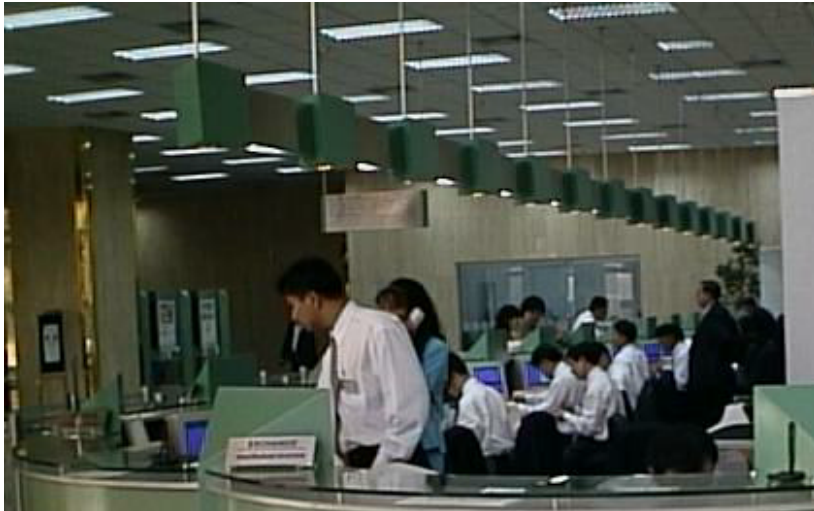
A typical LANDP retail banking customer operation