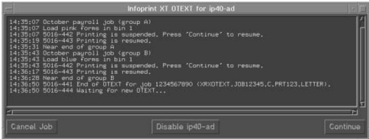
Figure 7. InfoPrint XT OTEXT message window for Processing Xerox jobs

When you submit an OTEXT job for processing, InfoPrint XT shows the window the first time that it finds an OTEXT message in the job. The title bar for the window contains the name of the InfoPrint Manager actual destination. Information in the message area of the window identifies the job and can include job-attribute information if it is present for the job. The message area also includes the text of the OTEXT messages that the job contains. The types of OTEXT messages are: