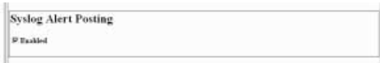
Figure 17. SNMP Syslog Alert Posting Configuration

Specifies whether alerts from the enabled alert group categories for this configuration will be sent to the Unix syslog daemon. If this option is enabled, the syslog daemon IP address must be entered in the syslog field in the Logpath Port section under the PrintPath menu item.