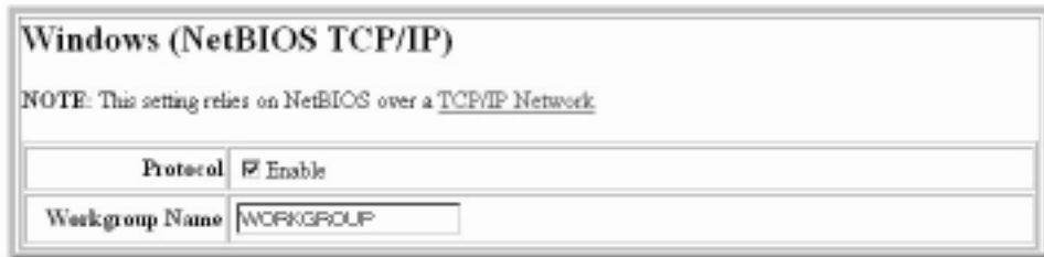
Figure 7. Windows Network (NetBIOS TCP/IP) Configuration

TCP/IP is used for Windows (i.e. Windows NT, Windows 95, and Windows for Workgroups) printing unless another protocol like IPX is available. Therefore, mandatory TCP/IP settings (i.e. IP address and subnet mask) are necessary on the Ethernet Interface. Go to "TCP/IP Network" on this form to fill in these settings if you haven't done so already.