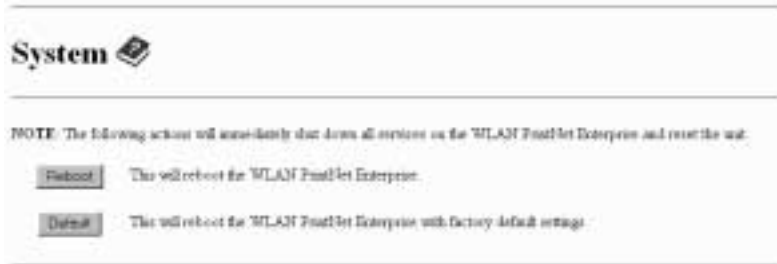
Figure 22. System Configuration

The System Configuration form allows you to change the Ethernet Interface's operation mode. Select "Reboot" to re-power the print server. Select "Default" to reset the print server and have it come up with factory default settings.