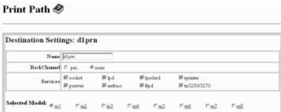
Figure 9. Print Path Configuration, Destination Settings