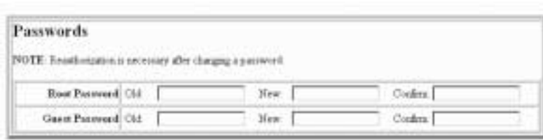
Figure 21. Administration Configuration, Passwords

Only a user with root privileges can alter the Ethernet Interface's settings. Guest users can only view settings but cannot alter them. Both types of users can be assigned passwords. To change a password, type in the old password in the "Old" field. Then type the new password twice: once in the "New" field, and once in the "Confirm" field.