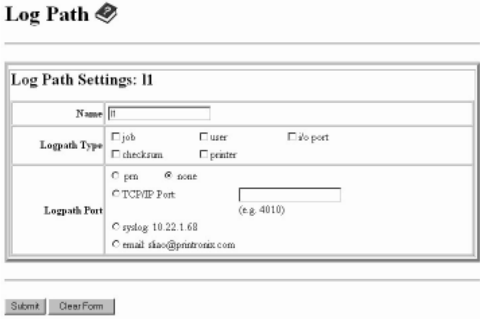
Figure 13. Log Path Configuration