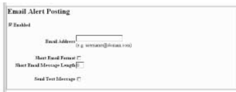
Figure 18. SNMP Email Alert Posting Configuration

Specifies whether alerts from the enabled alert group categories for this configuration will be sent to the specified e-mail address. If this option is enabled, the following information must be entered: