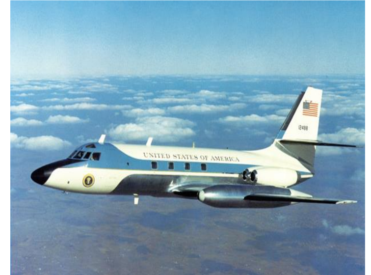
Lockheed C-140 Jet Star

Question: Why can't we have an ASRS-like process in our environments?